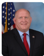
Congressman Glenn "GT" Thompson