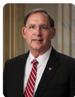
Senator John Boozman