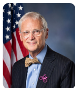
Congressman Earl Blumenauer