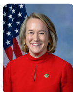
Congresswoman Nikki Budzinski