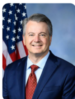
Congressman John Duarte