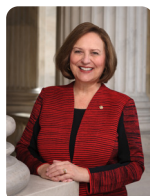
Senator Deb Fischer