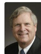
Secretary Tom Vilsack USDA SECRETARY OF AGRICULTURE