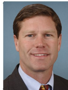
Congressman Ron Kind (D-Wisconsin)