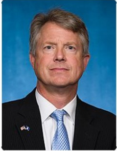
Congressman Roger Marshall (R-Kansas)