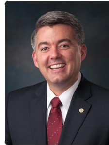
Senator Cory Gardner (R-Colorado)