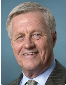
Congressman Collin Peterson (D-Minnesota)