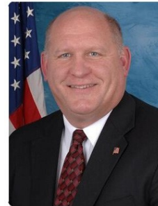
Congressman Glenn Thompson (R-Pennsylvania)