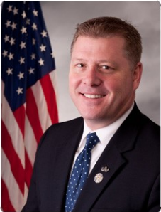
Congressman Rick Crawford (R-Arkansas)