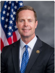
Congressman Rodney Davis (R-Illinois)