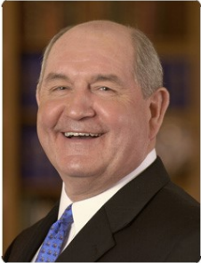
Sonny Perdue Secretary of Agriculture United States Department of Agriculture