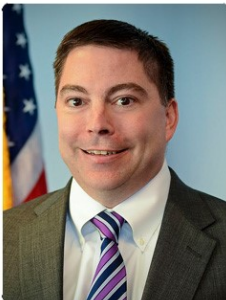
Michael O'Rielly Commissioner Federal Communications Commission