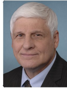
Congressman Bob Gibbs (R-Ohio)