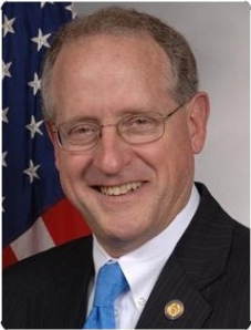
Congressman Mike Conaway (R-Texas)