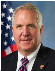
Congressman John Shimkus (R-Illinois)