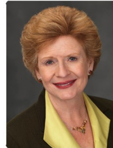
Senator Debbie Stabenow (D-Michigan)