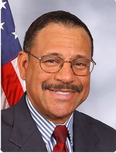
Congressman Sanford Bishop (D-Georgia)