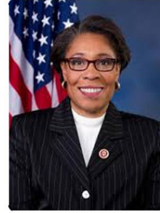
Congresswoman Marcia Fudge (D-Ohio)