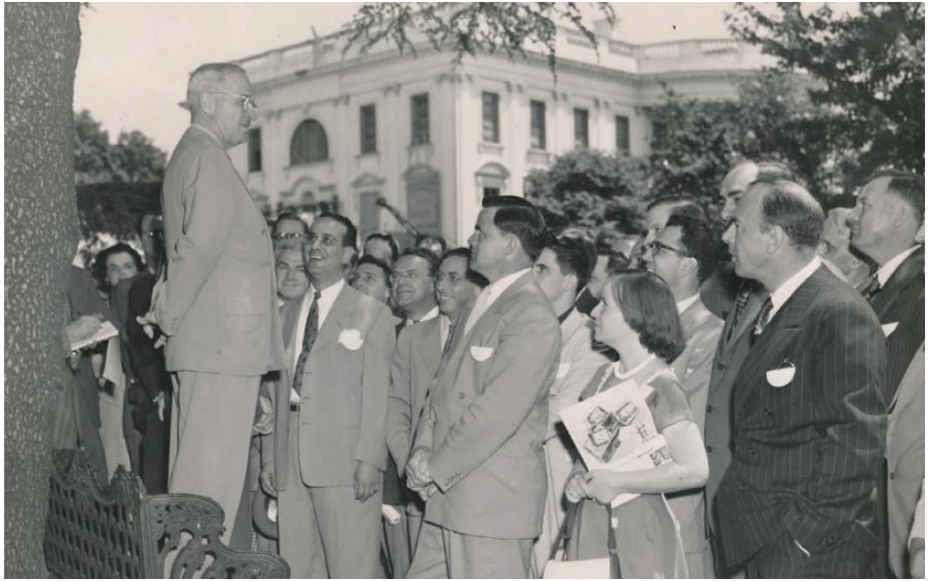
With the White House in the background, President Truman addressed radio farm directors at the 1950 Washington, D.C., USDA-NARFD meeting.