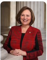
Senator Deb Fischer