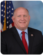
Congressman Glenn "GT" Thompson