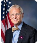
Congressman Earl Blumenauer