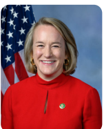
Congresswoman Nikki Budzinski