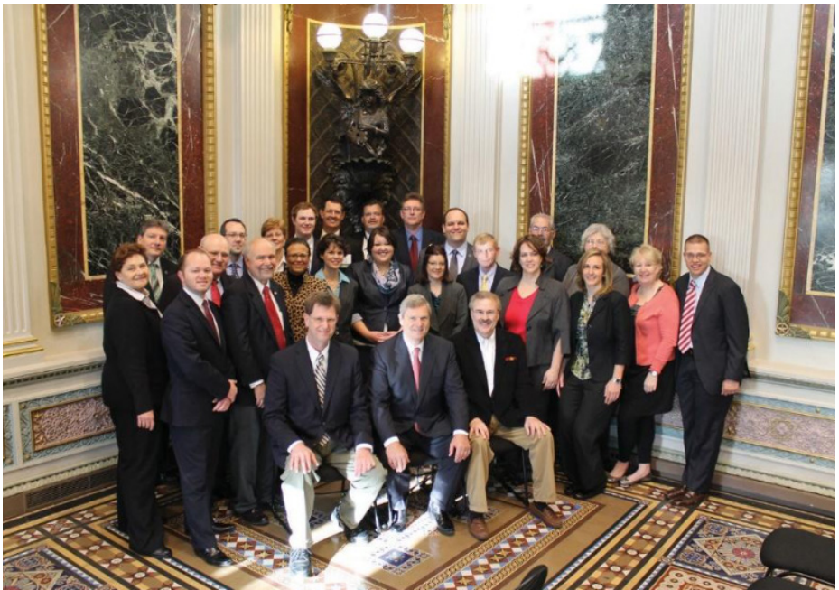
In 2012, NAFB members met with key USDA personnel (including U.S. Agriculture Secretary Tom Vilsack), and White House officials in the Indian Treaty Room in the Eisenhower Executive Office Building.