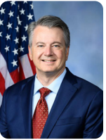
Congressman John Duarte