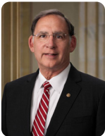
Senator John Boozman