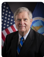
Tom Vilsack Secretary of Agriculture