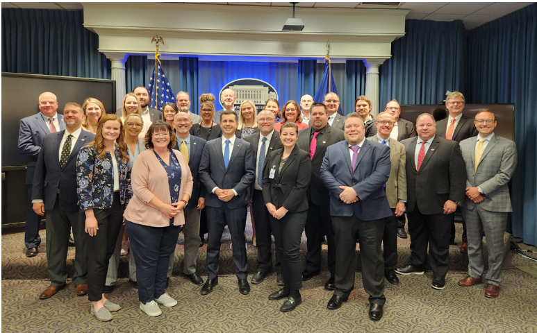
2023 Washington Watch participants pose for a group photo with Secretary of Transportation Pete Buttigieg.

Joint Committee on Printing; Joint Committee on the Library; Senate Agriculture, Nutrition and Forestry; Senate Commerce, Science and Transportation Committee; Senate Judiciary Committee; Senate Rules and Administration Committee Chair